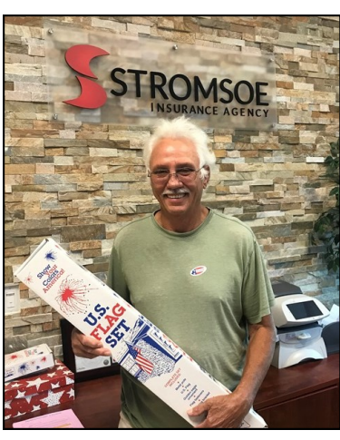
team is so honored to have given away over 59 American Flags. We can't wait to see what our Flag Exchange brings next year!! Thank you for the opportunity to serve and protection you, your loved ones and everything you work so hard for. What more can we do for you?